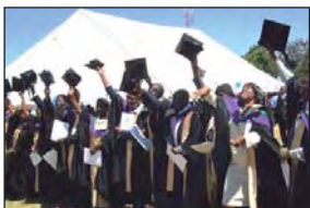
CSC Distance Learning Scholars' graduation ceremony in Zambia