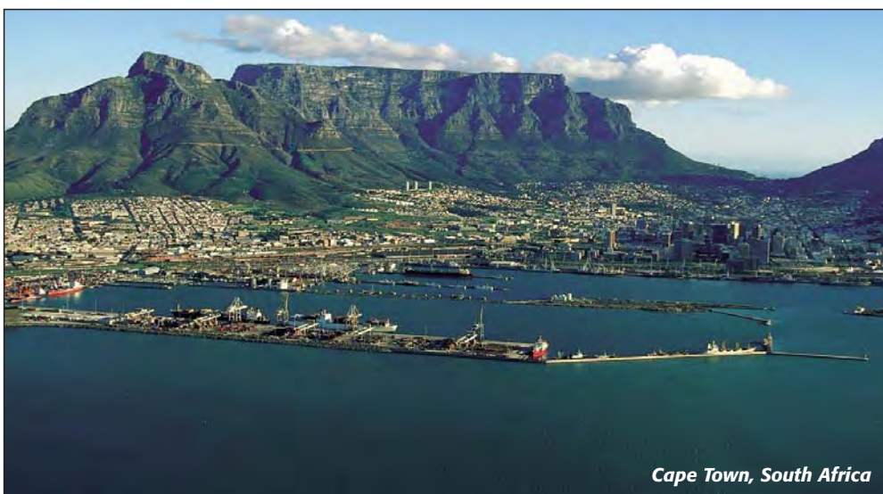
Cape Town, South Africa

One challenge HESA faces is working towards an increase in applications from students from designated groups who meet the eligibility criteria. There has been an increase from 14% in 2003 to 31% in 2007, but the aim is to increase this figure further. HESA would also like to see a rise in the number of split-site doctorates, which enable the candidate to remain in their home country for the majority of their degree.