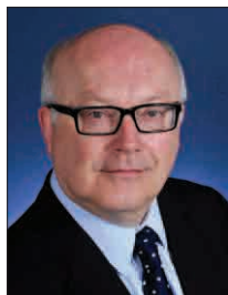
Senator George Brandis, 1981 Commonwealth Scholar and Attorney-General of Australia

Senator George Brandis (1981 Commonwealth Scholar from Australia, BCL Law, University of Oxford) has been appointed Attorney-General of Australia, following recent elections. He spoke of the pivotal part his scholarship has played in his life. 'Winning the Commonwealth Scholarship, and the opportunity to study at Oxford, was the defining moment of my career. Everything I have achieved in the years since for the betterment of my country was made possible by the Commonwealth Scholarship, for which I will be forever grateful.'