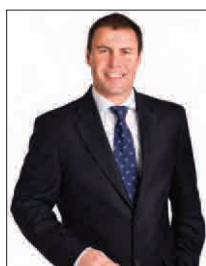
Josh Frydenberg, 1996 Commonwealth Scholar and Australian MP

Senator George Brandis (1981 Commonwealth Scholar from Australia, BCL Law, University of Oxford) has been appointed Attorney-General of Australia, following recent elections. He spoke of the pivotal part his scholarship has played in his life. 'Winning the Commonwealth Scholarship, and the opportunity to study at Oxford, was the defining moment of my career. Everything I have achieved in the years since for the betterment of my country was made possible by the Commonwealth Scholarship, for which I will be forever grateful.'