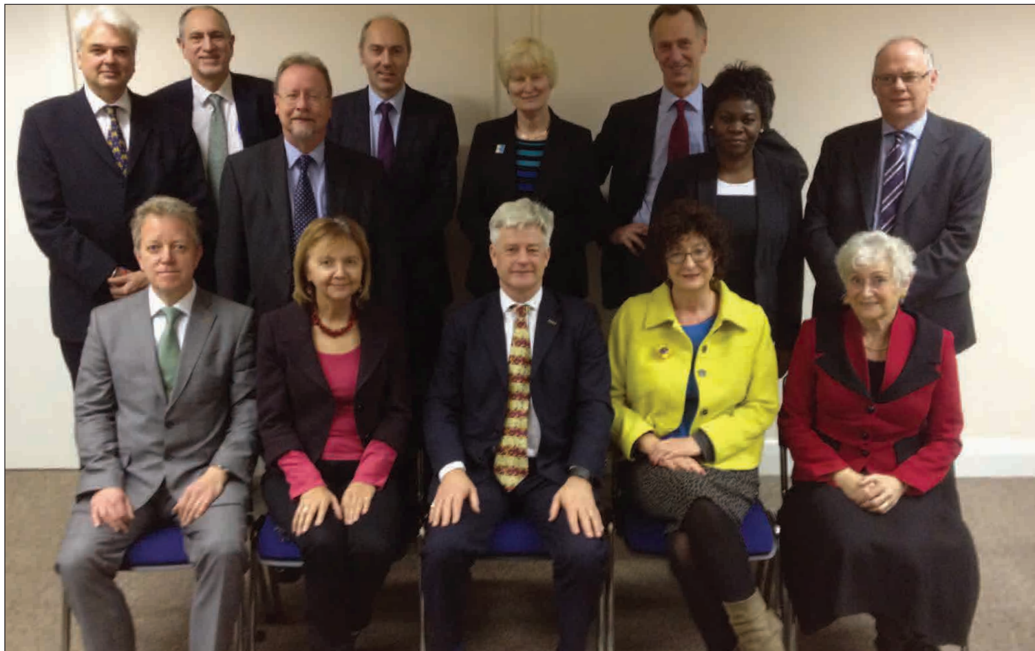
Commonwealth Scholarship Commissioners