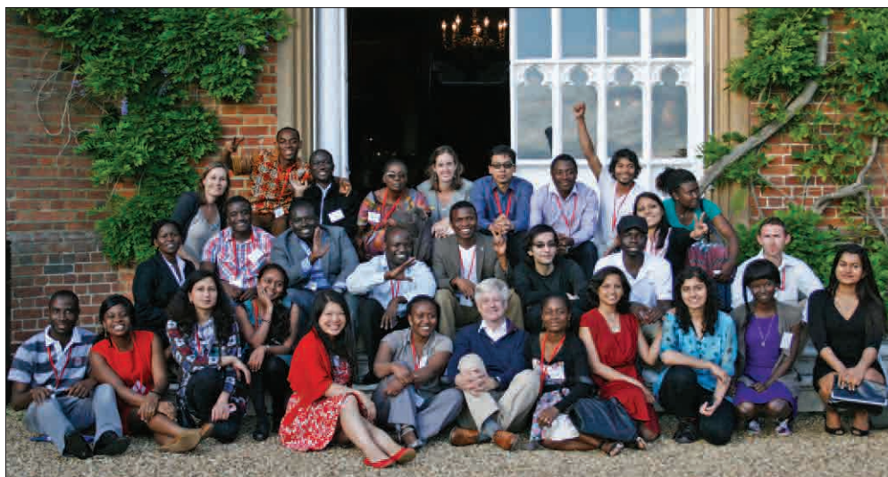
Commonwealth Scholars at the 2013 Commonwealth Residential School

There is so much we don't know and there is so much we are still learning today, but we mustn't forget that 100 years is not such a long time for humankind.