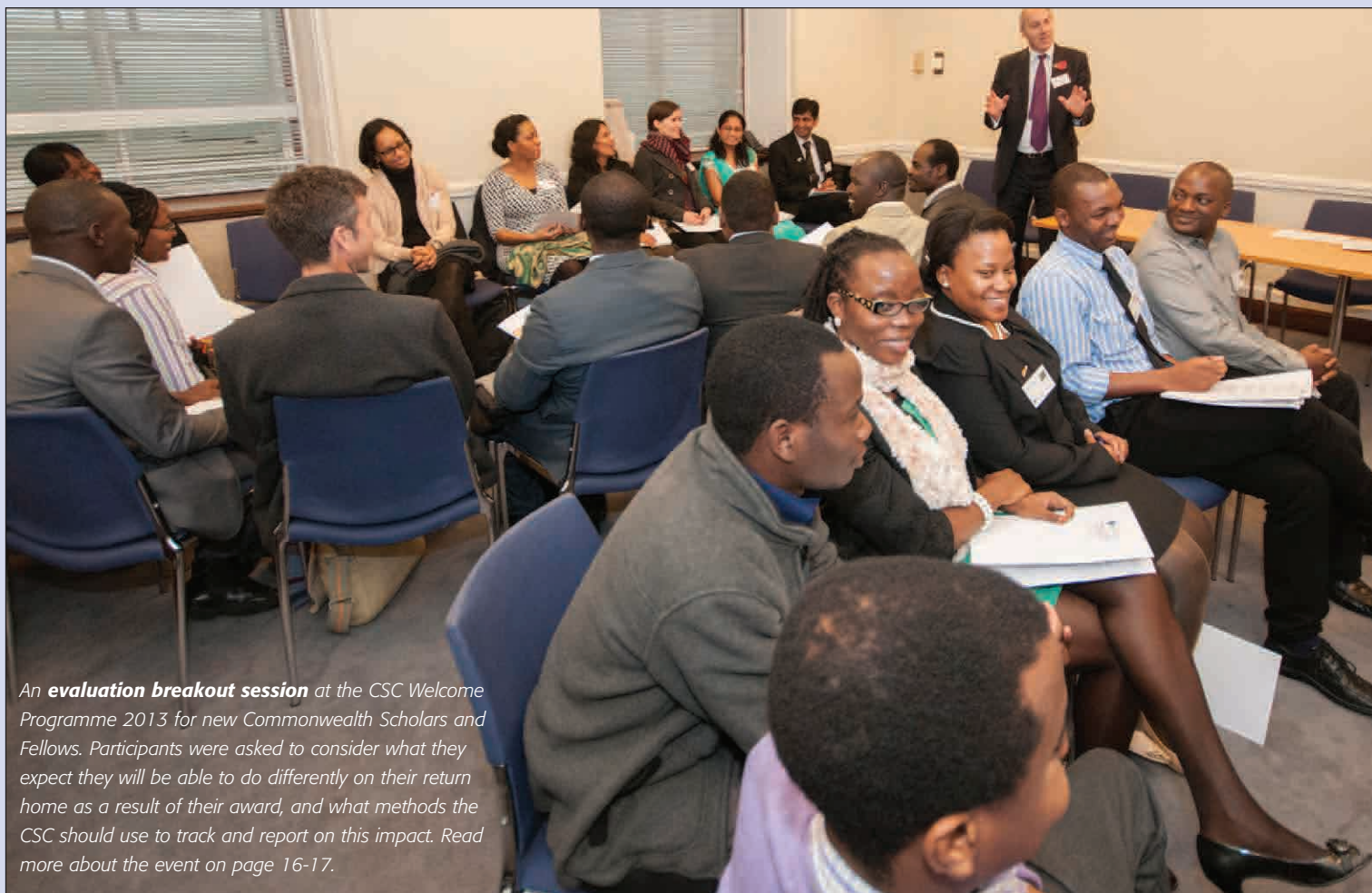
An evaluation breakout session at the CSC Welcome Programme 2013 for new Commonwealth Scholars and Fellows. Participants were asked to consider what they expect they will be able to do differently on their return home as a result of their award, and what methods the CSC should use to track and report on this impact. Read more about the event on page 16-17.

I think the Commonwealth Scholarship allows people to have an experience that would otherwise have been impossible.