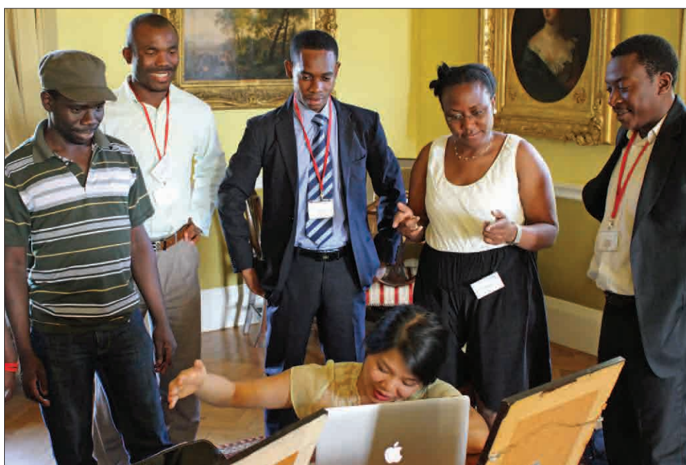
Discussing a manifesto for the 2113 world government elections