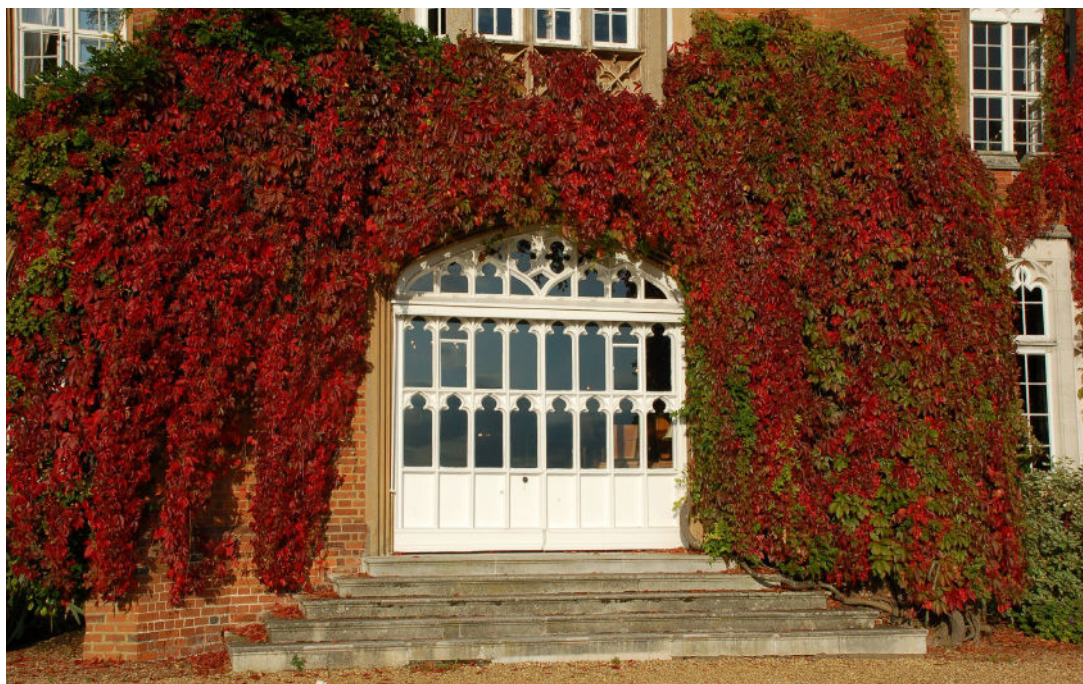
The Tapestry Hall door, which inspired the Cumberland Lodge logo