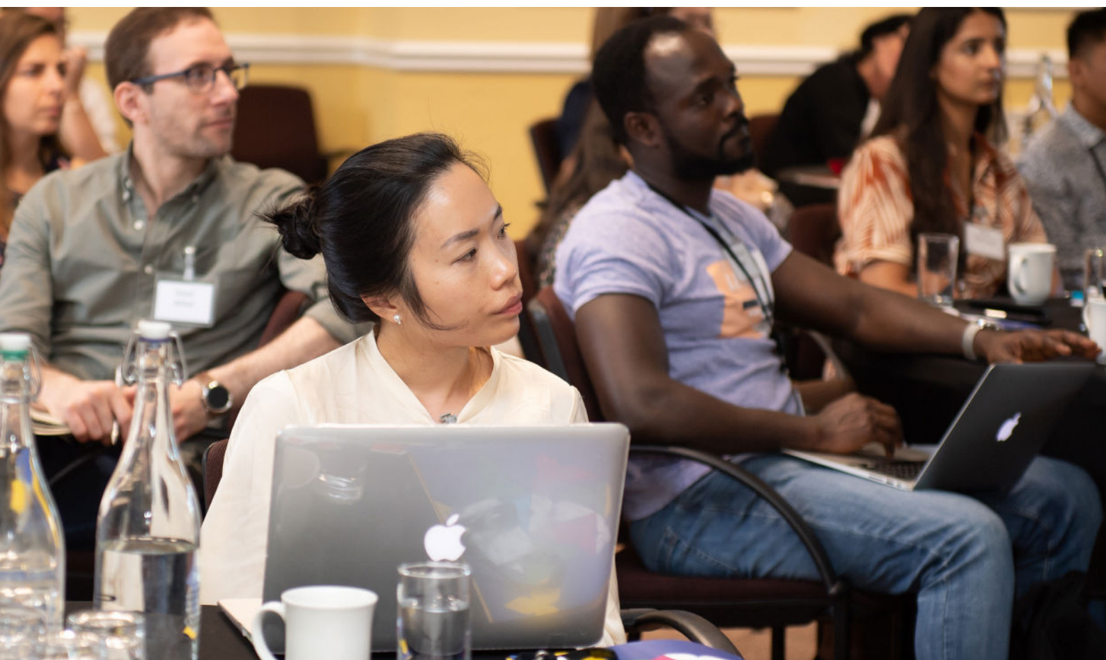
Students attending Life Beyond the Phd 2019 at Cumberland Lodge

You can also find out how to become a Friend of Cumberland Lodge for as little as £10 a year at cumberlandlodge.ac.uk/friends