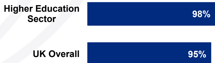
Figure 3. Positive Alumni Sentiments Towards United Kingdom

These positive sentiments are further reflected by the fact that 100% of Commonwealth Scholars would recommend studying and living in the UK to others in their home country.