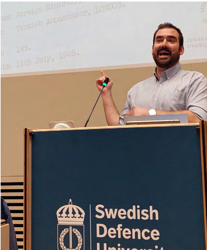
Lecturing on Churchill and de Gaulle at the Swedish Defence University - Försvarshögskolan.