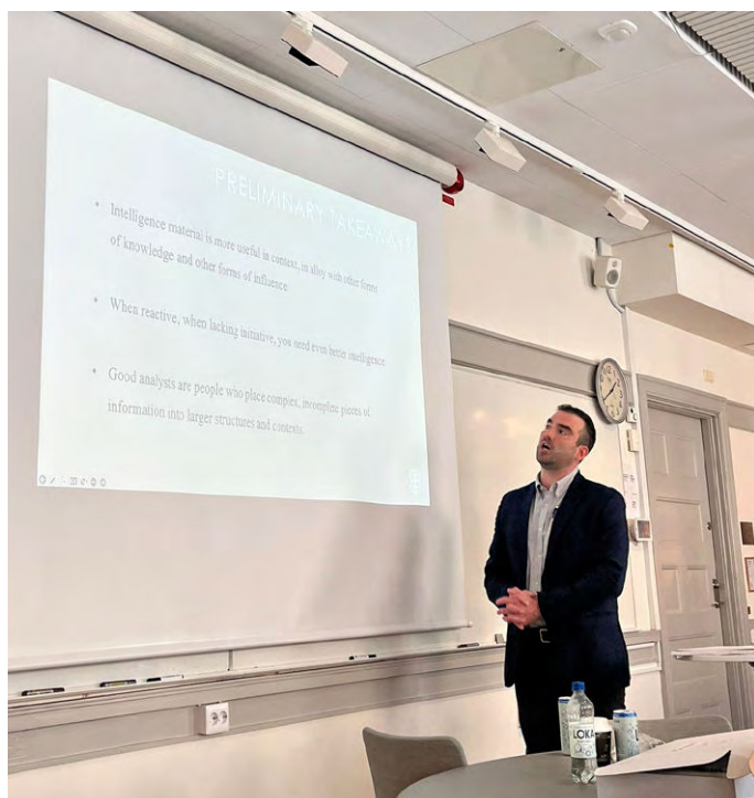
Lecturing as Course Co-Director of Applied History 767: World Order and Present Challenges, flagship course of the Centre for Statecraft and Strategic Communication.