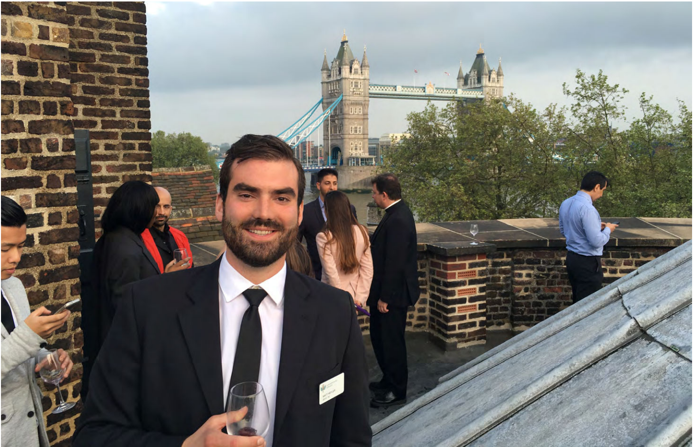
Touring the Tower of London with Goodenough College whilst studying at King's College London.